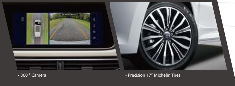
• 360° Camera

• GAC MOTOR 270T Engine Superior power is the only way forward. The all-new 270T engine. It combines world-leading in-cylinder direct injection and turbocharging technology to provide high power and better fuel economy.