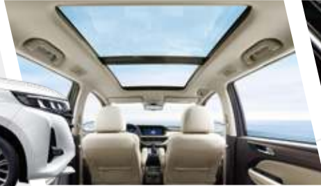
• Full-Size Panoramic Sunroof