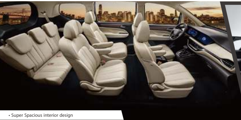
• Super Spacious interior design

Witness true style and turn heads as you fly by Sharp and Elegant Exterior. Seize the eyes of the world, showing your style at every occasion.