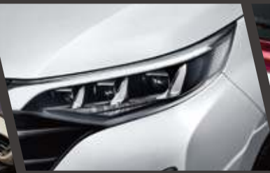
• LED Headlamps with Matrix Structure