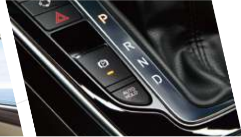
• EPB + Auto Hold