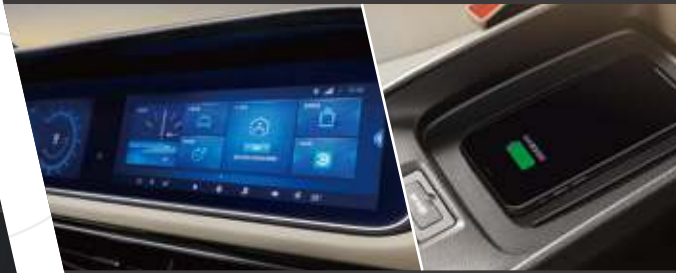
• HD color 8 inch touch screen with dual mode Navigation.