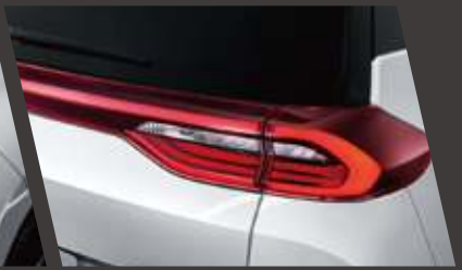
• LED Tail Light