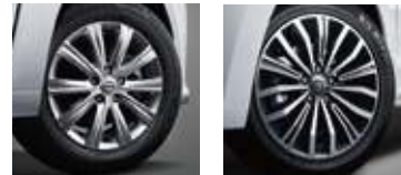
16" Aluminum Alloy Wheel 17" Aluminum Alloy Wheel