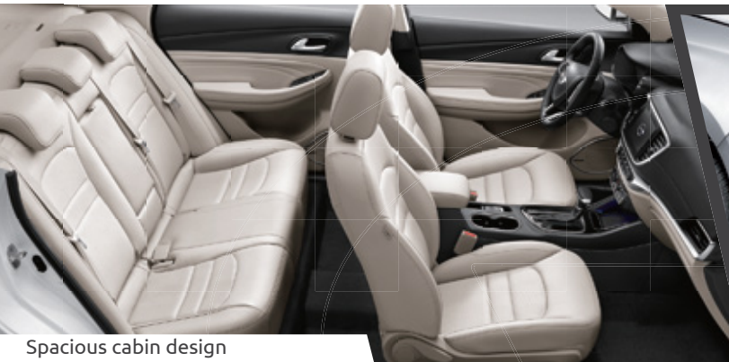
Spacious cabin design

Beyond just being a vehicle, the All-new GA4 expands, the pleasure of motoring to new dimensions that will soothe all your senses. It is invariably a healing space tailored just for you.