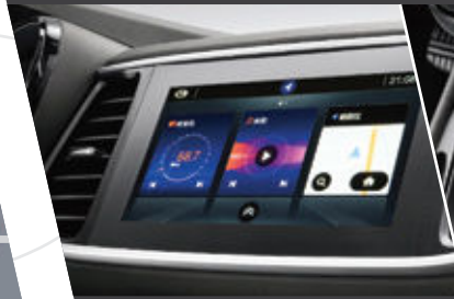
HD color 8 inch touch screen with dual mode Navigation.