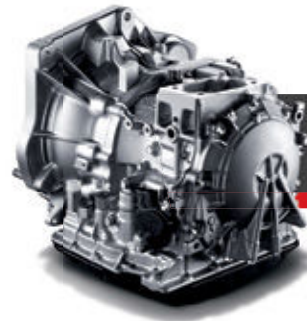
All new Aisin 6-speed automatic transmission