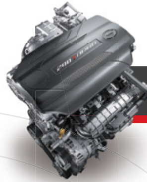
GAC MOTOR 200T Engine

The 4-wheel independent suspension employs a stabilizer bar and McPherson struts in front and multi-link suspension geometry in the rear, allowing all four wheels to travel in a controlled manner while maximizing stability and ride comfort.