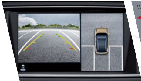
360° panoramic image system

Designed for total immersion in the driving experience.