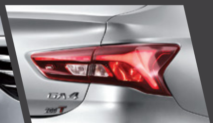
LED Tail Light