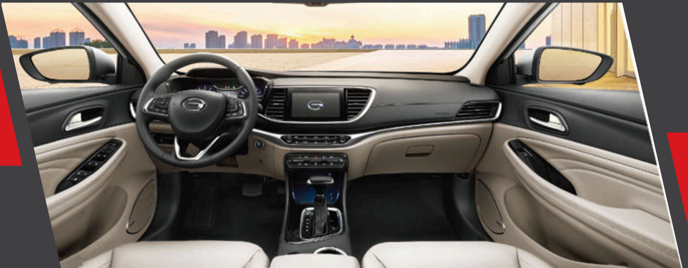
Designed for total immersion in the driving experience

Redefining the understanding of space utilization. Supreme comfort and fingertip control offer you a sense of serenity every time you slip behind the wheel and hit the road.