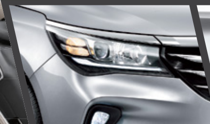
Luxury that draws on art and design