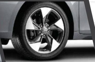
Completely-new dazzling five-spoke wheel