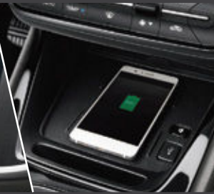
Wireless Smartphone Charging System

Redefining the understanding of space utilization. Supreme comfort and fingertip control offer you a sense of serenity every time you slip behind the wheel and hit the road.