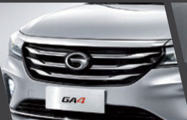
Inheriting the DNA of GAC Motor Flying Dynamic